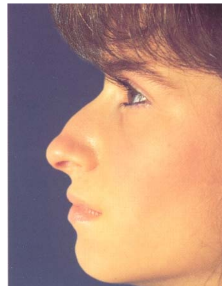
Before and After photographs from Dr. Sachs' files illustrate Finesse Sculpting Rhinoplasty used to refine the tip of the nose, creating a better overall balance to the face