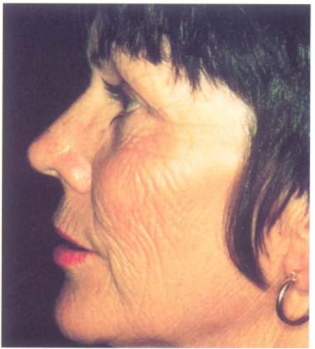
Before Laser Treatment